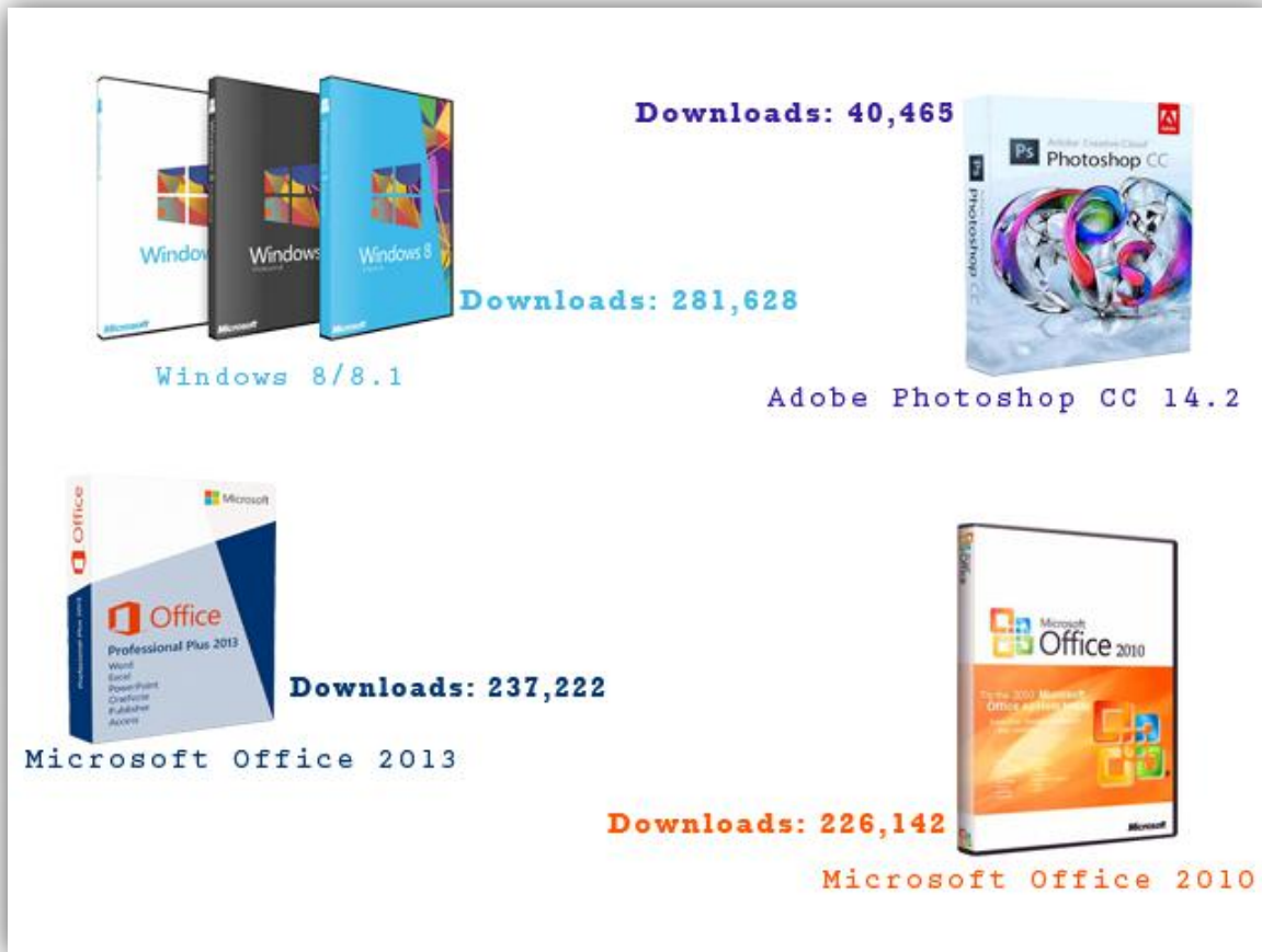
Figure 3: Total Downloads of these softwares from Kickass Torrent

From the above info graphic it is very clear that these three Microsoft products (i.e. Microsoft Office 2010 & 2013 and Windows 8/8.1) has been downloaded almost 7.5 lakh times in last one year from only one site i.e. kickass torrent. So, from this study we can understand how much Microsoft or any other software company is losing due to online piracy, because if only one site recorded so many download, just imagine the vastness of overall internet piracy of the softwares.